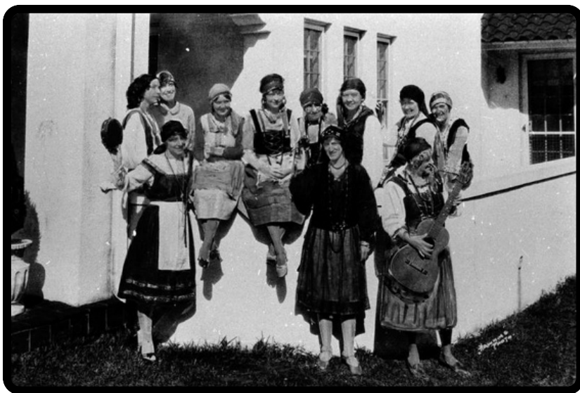
LADIES OF THE THURSDAY MORNING CHORUS IN GYPSY MUSICIAN COSTUME FOR THE FIRST VENETIAN NIGHTS CARNIVAL.

Article courtesy of Manatee County Library Archives