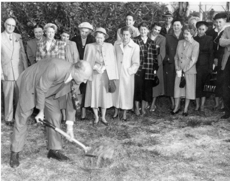
BWC Members at the ground breaking for the Manatee Players Club building

The troupe was thrilled and the community wanted more. On January 25, 1948, the traveling troupe of thespians received its charter as a non-profit organization The Manatee Players, Inc. The following year the fledgling organization presented a full season of performances at either the Women's Club, Palmetto Women's Club or Ballard School, playing to expanding audiences and gaining popularity with every production. Rehearsals were held at the Bradenton Pier, the Armory, the Elks Club, the Girl Scout's Little House, and the Water Works building. Many rehearsal sessions also were held in private homes. A season membership cost $12.50.